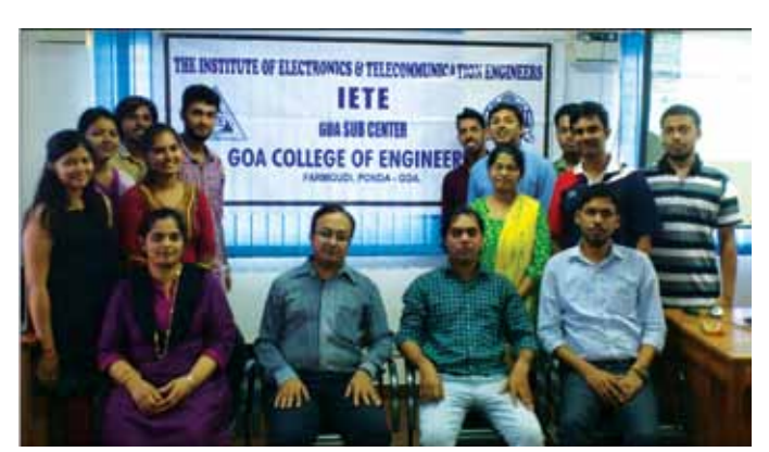
Participants of workshop - Industrial Automation

• The Centre organized a workshop on "Industrial Automation with Allen-Bradley PLC" during 4<sup>th</sup>-5<sup>th</sup> Aug 2016 at ET Dept, Goa Engineering College (GEC), Goa. The resource faculty Shri Sandip Mone took upon various topics like timers, latched outputs, interlocking relating with industrial applications on the first day. Next day advanced instructions like data transfer, sequencer, counter, bit shift master control instructions. Analog input output points were introduced and programming for a particular applications were taught. PIL hardware connections were also demonstrated at the end of the