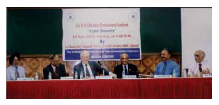
Dignitaries on dais during Endowment Lecture

AVSM, VSM (Retd) on 13th Nov 2016 at the Centre. In his address, the speaker highlighted the objective of the topic and said it was all about protecting the interest of those relying on information in the cyber world from the harm resulting from failure of availability, confidentiality and integrity. He mentioned that the security objective can be considered as achieved when the information is disclosed to only those who have the right to know (confidentiality), information is protected against unauthorized changes (integrity), information systems are available and are usable (availability), and transactions are not disputed (non-repudiation and authenticity). Thus, cyber security is a key aspect of e-Governance. According to the speaker, the Indian way of Cyber Security is comparable to holistic health model. The lecture generated a lot of interest among the audience who were interested in knowing more on protections from cyber criminals on financial transactions made through Internet or mobile phones. Lt Gen PD Bhargava, PVSM, AVSM (Retd) was the Chief Guest on the occasion, which was attended by around 60 corporate members from centre.